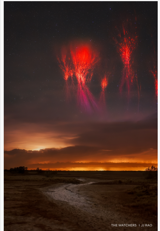
Capture the Dark category, first place winner: "The Watchers" by JJ Rao. Rare red "jellyfish" sprite over the tidal flats of Western Australia.

The result is more than a gallery of stunning images—it's a call to action to protect the night.