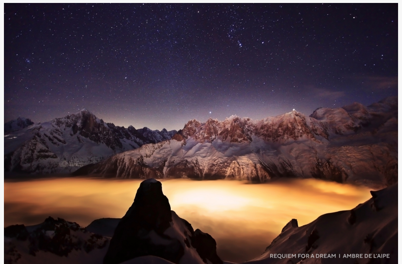
Impact of Light Pollution category, first place winner: Requiem for a Dream by Ambre de l'Alpe