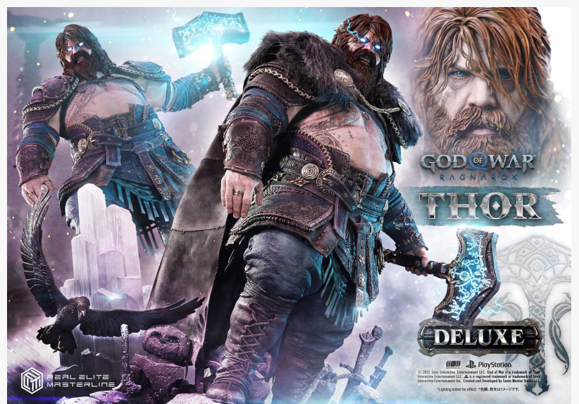
God of War: Ragnarok Thor

Included interchangeable parts consist of an alternate head with an angry expression and a left arm posed differently with Mjöltnir. Both parts have built-in LED lighting. A head stand