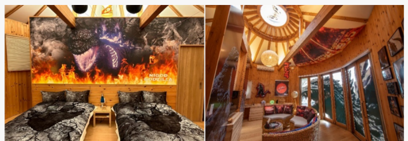
Godzilla-themed Room "Monster Land" at Grand Chariot Hokutoshichisei 135°