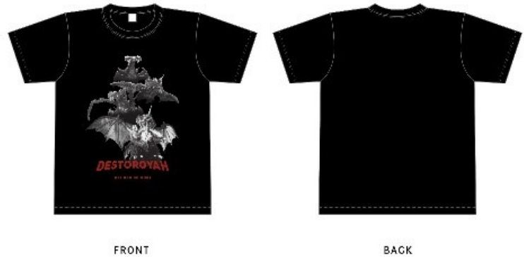
Destoroyah T-Shirt (3,828 yen, tax included)