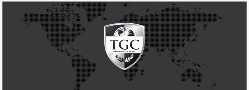
TGC TKAWEN GLOBAL CERTIFICATION

extends far beyond national borders. Its solutions power universities, training institutions,