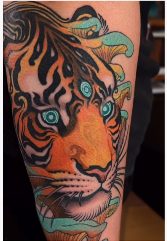
A custom neo-traditional tattoo featuring a psychedelic art inspired tiger by Cora Mylene.

Cora Mylene Cora Mylene Tattoos +1 979-561-7002 email us here Visit us on social media: Instagram