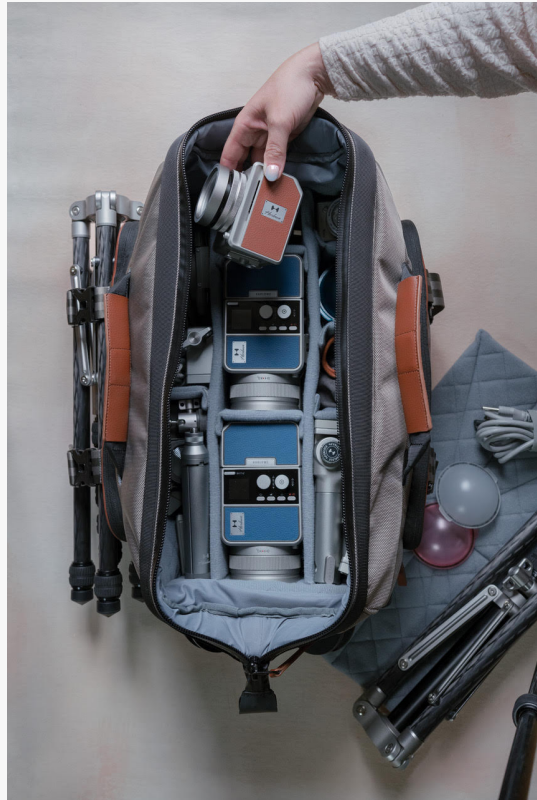
The Emerson Edition by Corbin Gurkin

The kit includes two Avant Max-X 80W Creator Kits, a Mini II 20W Standard Kit, a Micro 8 Spectra Master Kit with 36,000 adjustable tones, two 250cm carbon fiber light stands, and an adjustable lens for the Avant Max-X, all housed within a weatherproof, shock-resistant carry-on roller case designed for effortless travel and protection.