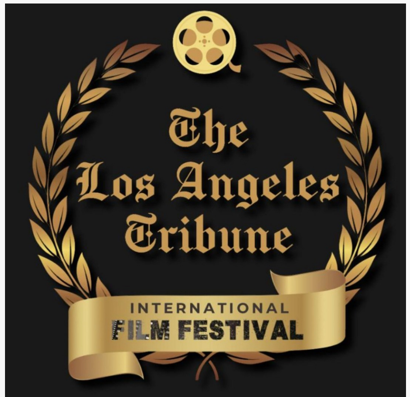
Los Angeles Tribune Film Festival