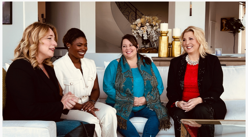
Pillars of Power Movie Producers