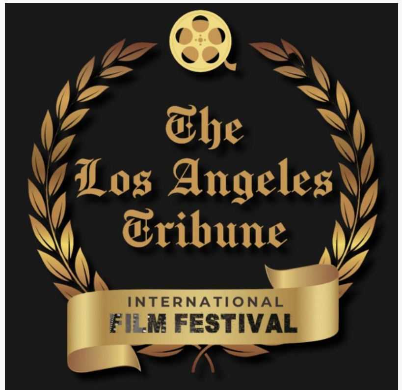
Los Angeles Tribune Film Festival