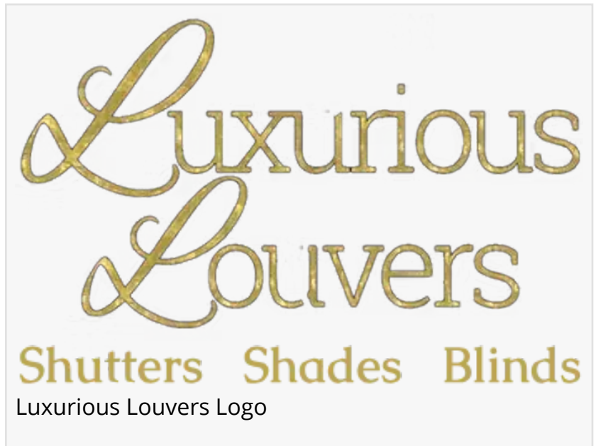
Luxurious Louvers Logo

Luxurious Louvers, a window treatment company based in Fayetteville, NC, has launched a new website aimed at enhancing access to custom interior and exterior window solutions for homeowners and commercial clients across the region. The website is designed to streamline the process of learning about products, scheduling consultations, and exploring available services.