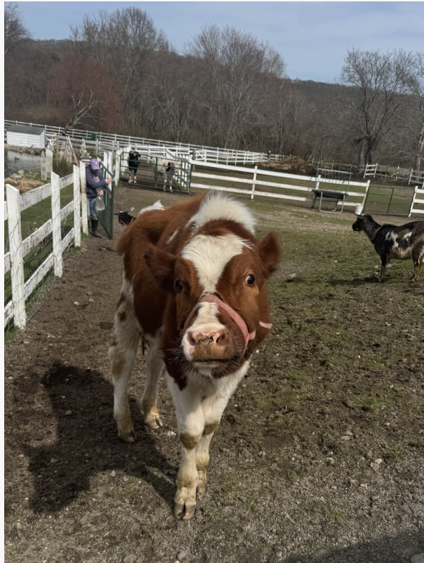
Hayden Foundation Visits West Place Animal Sanctuary in Tiverton, Rhode Island, Meeting Rescued Farm Animals.