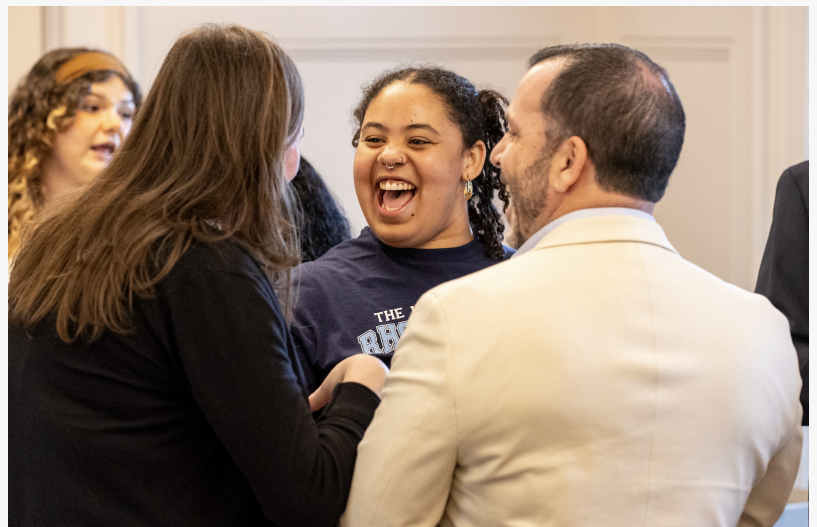
Hayden Foundation Celebrates URI Student Success Scholarship Recipients with University of Rhode Island Leaders