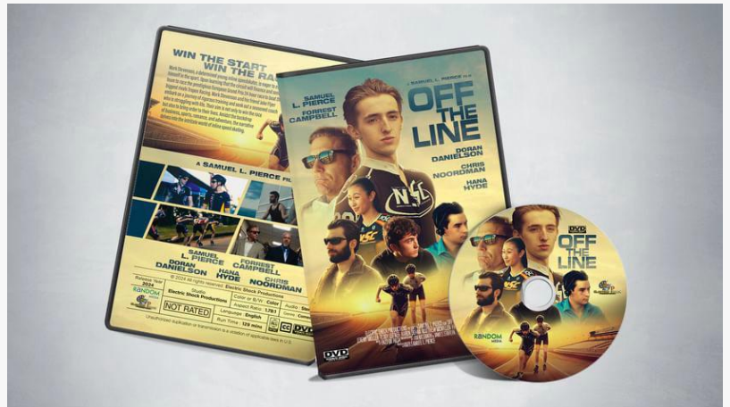
Available on DVD