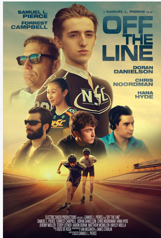
Off The Line Poster