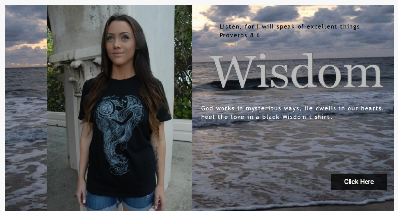
Wisdom--Tshirt - GodPowerTees