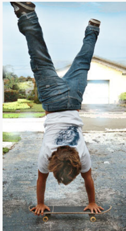
God Inspired Clothing - GodPowerTees