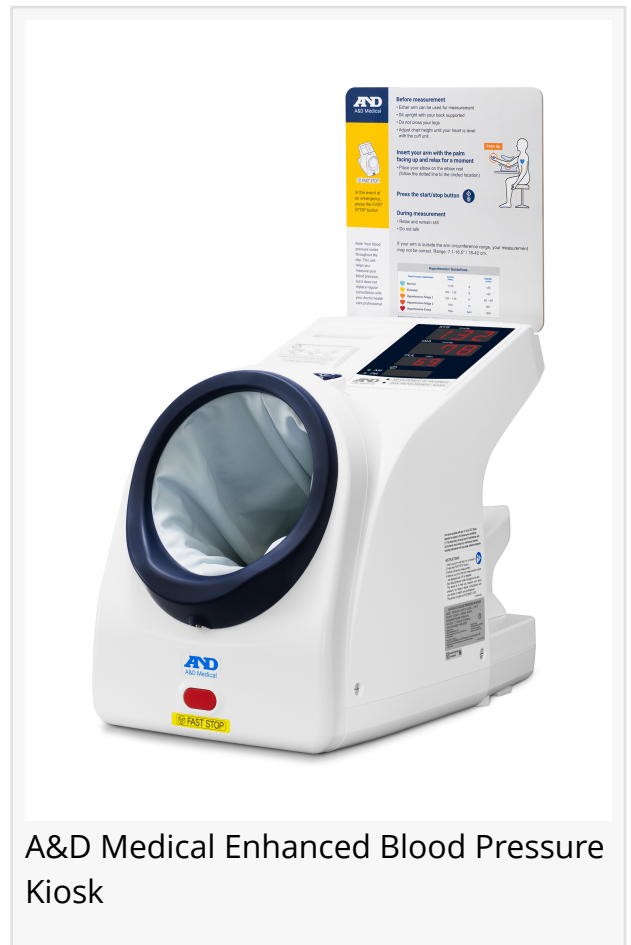
A&D Medical Enhanced Blood Pressure Kiosk

According to the Public Health Agency of Canada, hypertension is a major contributor to cardiovascular disease, which remains the second leading cause of death in the country. The economic burden is equally staggering, with high blood pressure costing the Canadian healthcare system are projected to be over $20B dollars in 2025.