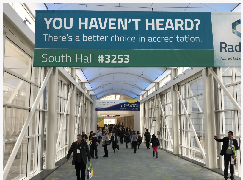
RadSite RSNA Banner