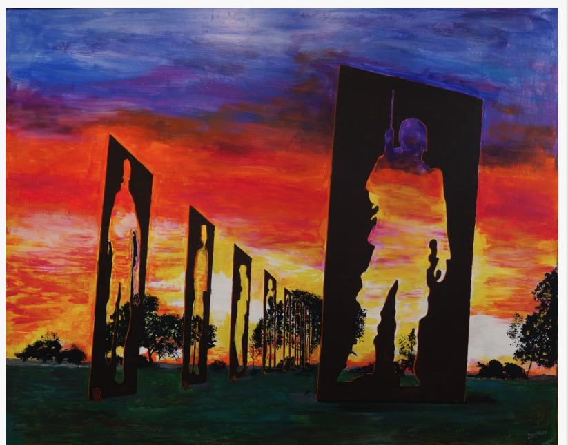
The "War at Home Memorial" painting is on display in the Warriors HeArt Gallery at Grunt Style HQ.