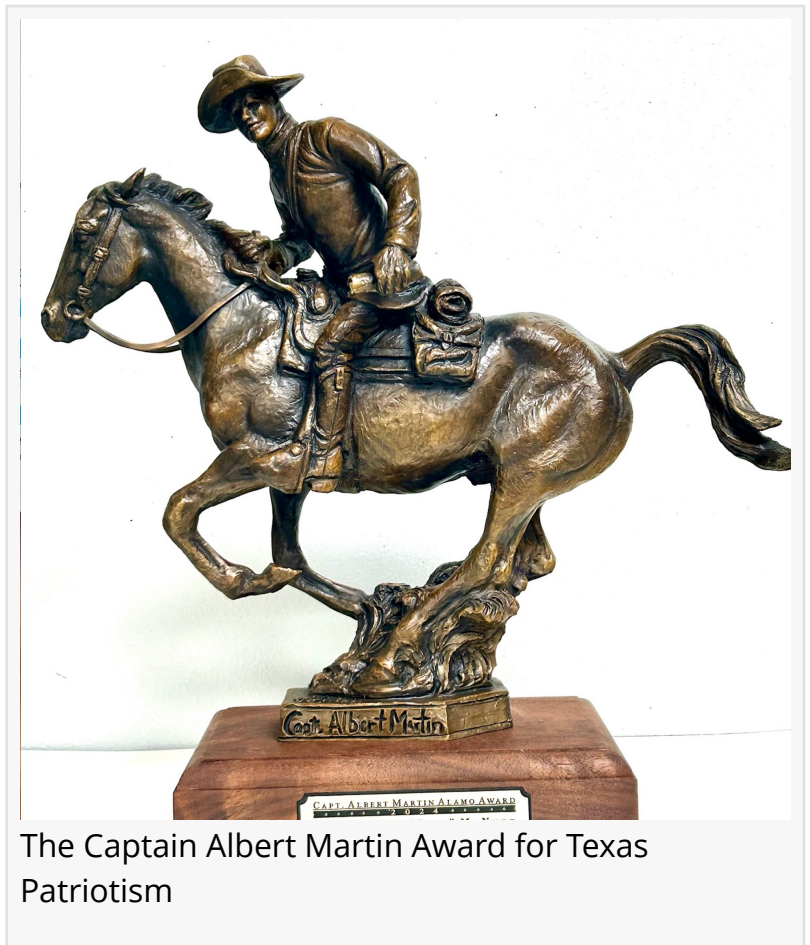
The Captain Albert Martin Award for Texas Patriotism