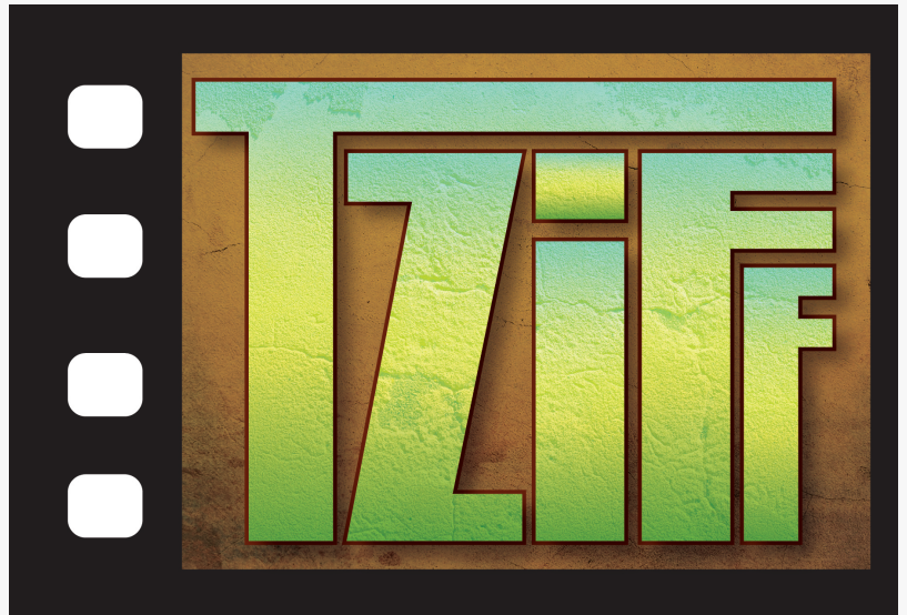
Tarzana International Film Festival

The festivities kick off with an exclusive opening night reception hosted by Porsche of Woodland Hills, the festival's Title Sponsor. Guests will then hit the red carpet for the west coast festival premiere of 'Gunner', an adrenaline-fueled action thriller starring Luke Hemsworth and Morgan Freeman and directed by Dimitri