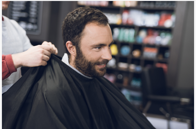
barber shop in Manhattan