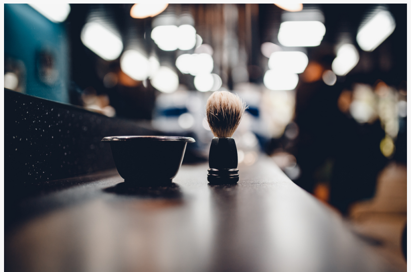
Traditional Barber Shop

Additional services that extend beyond hair and beard grooming include the Black Peel-Off Mask ($20), Cleansing Facial ($45), and Hair Wash & Condition ($10), which appeal to individuals incorporating skincare into their barbershop routine. These services reflect an industry-wide shift toward full-spectrum grooming that combines appearance with self-care.