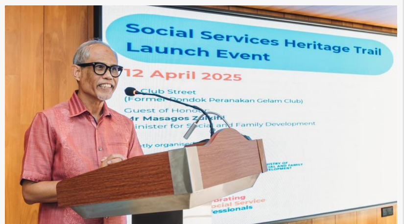
Minister for Social and Family Development Masagos Zulkifli speaking at the launch of the Social Services Heritage Trail on April 12.

/EINPresswire.com/ -- In a significant stride towards preserving and celebrating the nation's social development narrative, the Singapore University of Social Sciences (SUSS), in collaboration with the Ministry of Social and Family Development (MSF), has launched the Social Services Heritage Trail . This initiative commemorates the evolution of Singapore's social services sector, highlighting the contributions of pioneers and institutions that have shaped the nation into a compassionate and caring society.