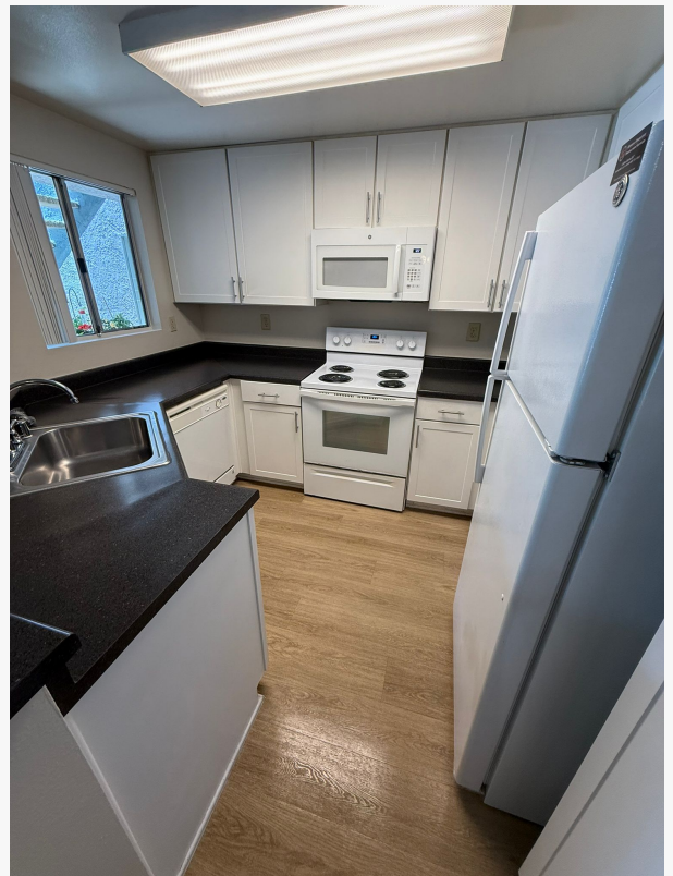
Standard cleaning services