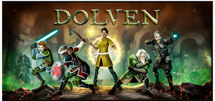
Dolven Steam Capsule Image

experiencing the game's narrative-driven tactical combat. A free demo of Dolven will be available to both Mac and PC users during Steam Next Fest in October 2024.