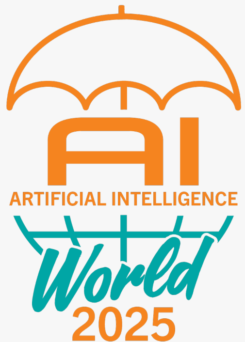
AI World Conference San Diego

His keynote will introduce insights from his forthcoming volume, “The AI Governance Playbook ” (Bloomsbury, 2025)—a practical guide for managers, policymakers, attorneys, and risk and governance professionals navigating the rapidly evolving AI landscape. The address will explore strategies for mitigating algorithmic bias, operationalizing AI governance frameworks at scale,