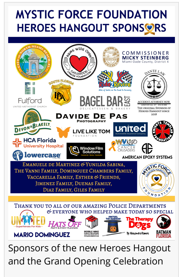
Sponsors of the new Heroes Hangout and the Grand Opening Celebration