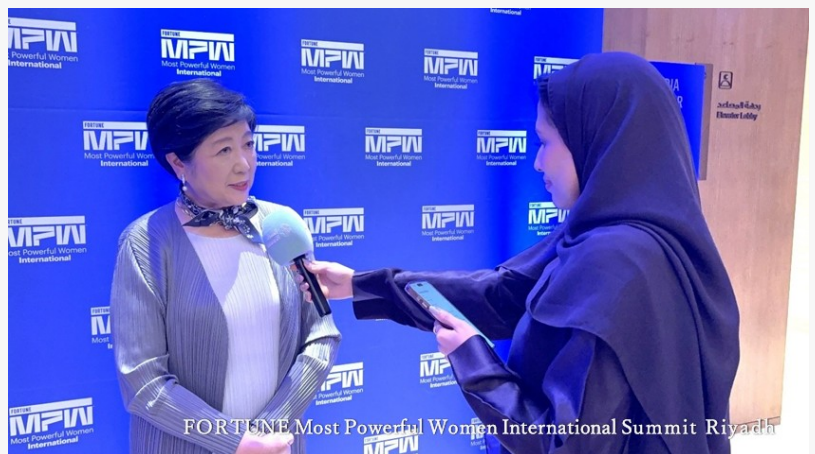
FORTUNE Most Powerful Women International Summit Riyadh