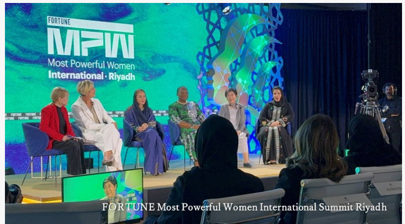
FORTUNE Most Powerful Women International Summit Riyadh

"First of all, passion," Ms. Koike replied. "And a concrete blueprint to how to make people be happy or happier. And also, the skill to get the empathy from my people," she added. "This is