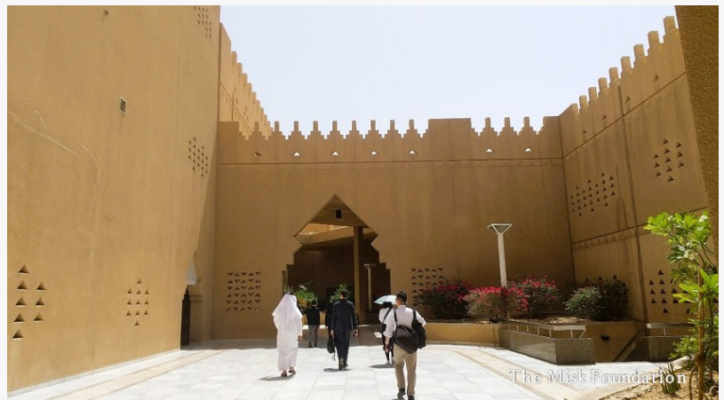
The Misk Foundation