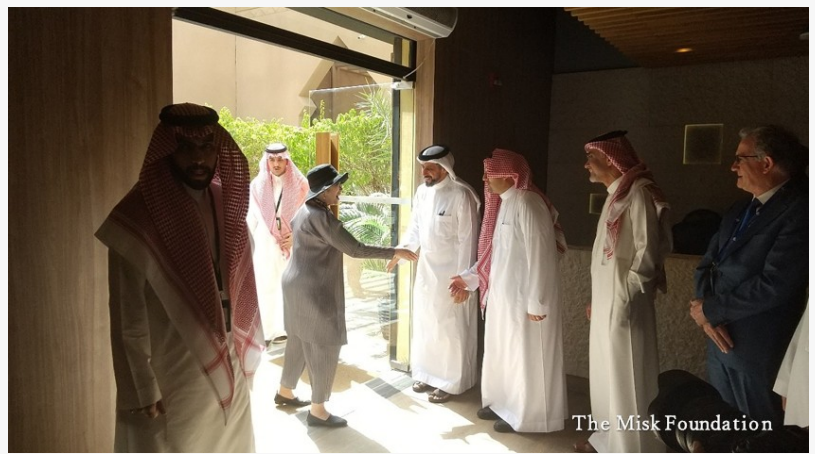
The Misk Foundation

She noted that women, who make up about half of Tokyo’s workforce, account for only 20% of decision-makers. “The power of women, who have been underutilized,” is central to “driving change in a society,” she said.