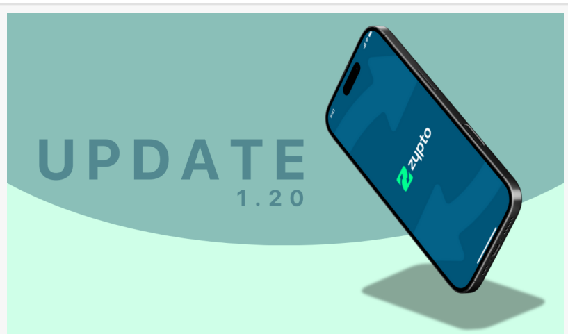
Zypto's Crypto Wallet and Payments Super-App for iOS and Android

Many crypto users keep assets in a familiar mobile wallet or on hardware and hesitate to move funds just to try something new. External Payments removes that trade-off: keep custody where