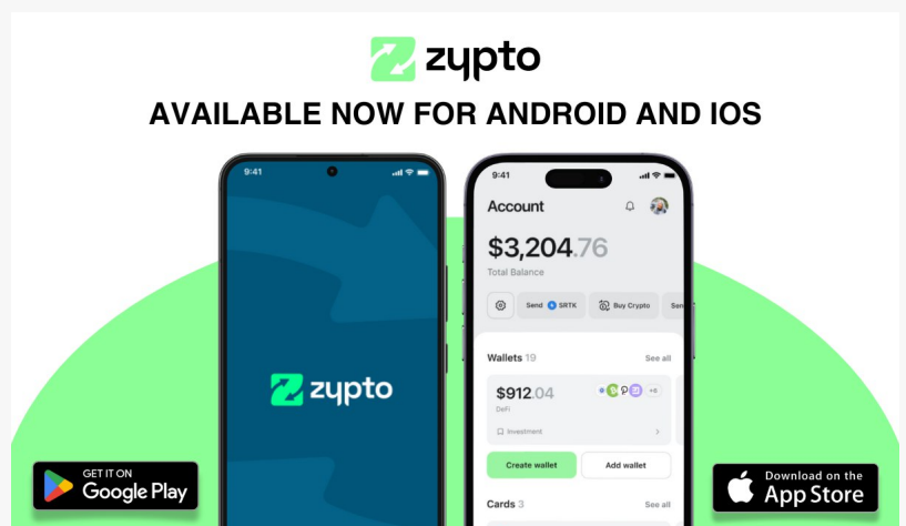
Spend your crypto your way with Zypto's Next Generation All-in-One Crypto App