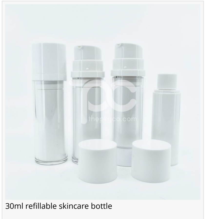
30ml refillable skincare bottle

LONG BEACH, CA, UNITED STATES, August 22, 2025 /EINPresswire.com/ -- The Packaging Company has announced the development of a new 30ml refillable skincare bottle , expanding its tailored solutions for skincare and personal care packaging. Developed to support precise dispensing, reusability, and formulation integrity, the compact airless bottle format addresses a growing demand for sustainable, efficient, and brand-adaptable primary packaging in the skincare industry.