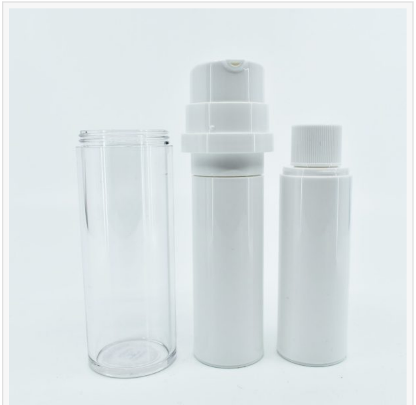
50ml refillable skincare bottle

As an airless pump bottle manufacturer and supplier, The Packaging Company follows strict quality assurance protocols that address filling line compatibility, seal integrity, and ergonomic functionality. The bottle accommodates a variety of standard pump heads, sleeves, and protective caps used across the skincare industry.