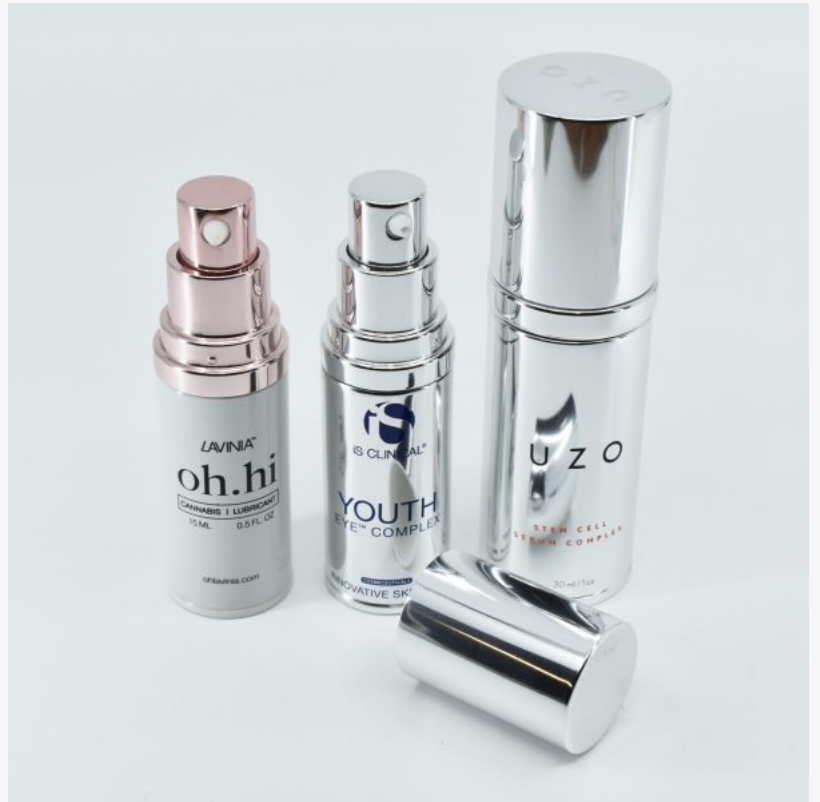
Airless Pump Bottles