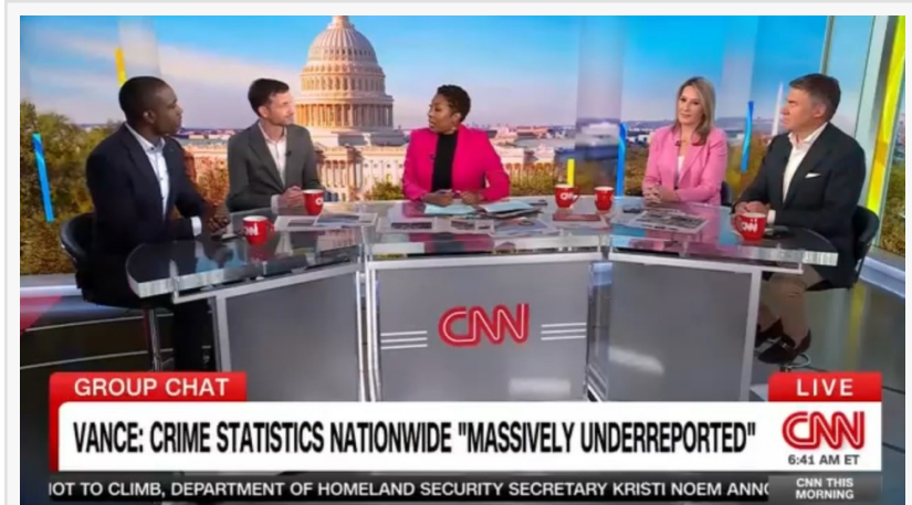
CNN This Morning on 8/21/2025