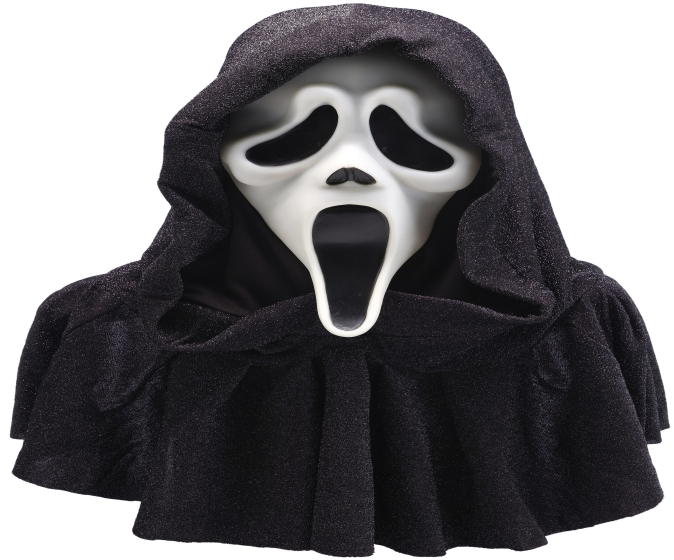
SCREAM (2022) - Ghostface Mask est. $5,000 - $10,000 (£3,730 - £7,462)