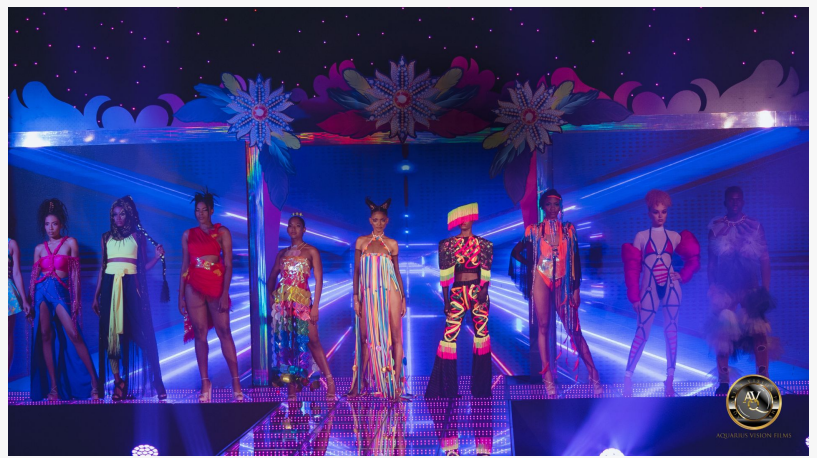
Carnival Catwalk Models