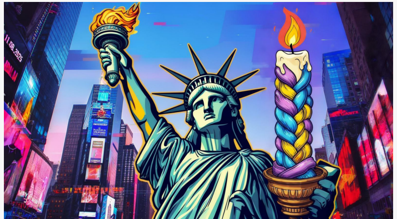
Largest Havdalah in the World

NYC, NY, UNITED STATES, September 11, 2025 /EINPresswire.com/ -- This November, Kii will make history by hosting the world's largest Havdalah ceremony in the heart of Times Square, New York City. The unprecedented event will gather thousands from across the globe in a World Record celebration and a powerful display of Jewish unity, identity, and tradition.