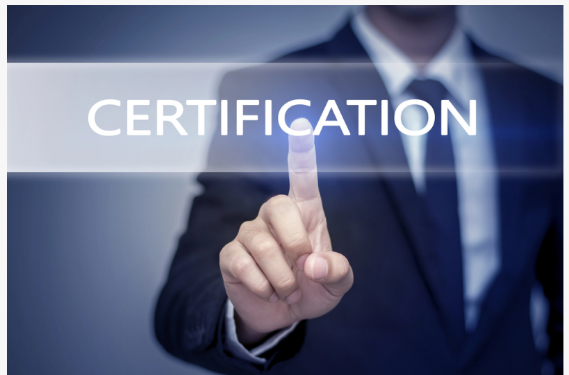
Health Care Certifications