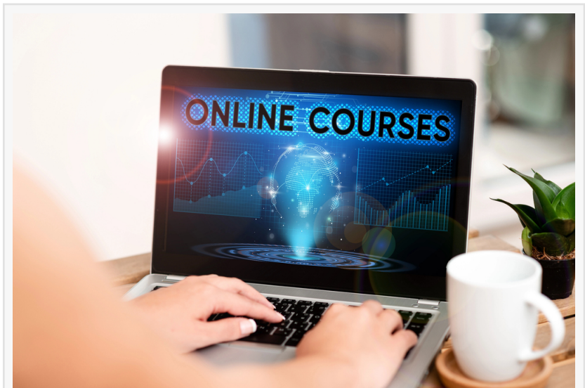
Online Continuing Education Courses