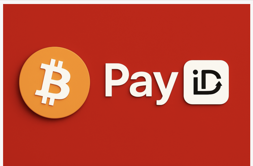
Buy Bitcoin with PayID