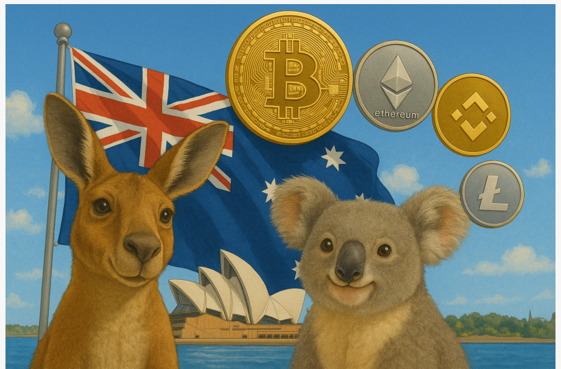
Buy Crypto in Australia