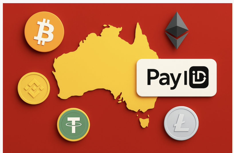
Buy Crypto with PayID