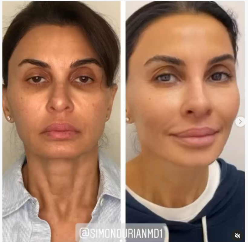
Coolaser™ at Epione Beverly Hills: Refresh, Rejuvenate, and Reverse Time

Traditional facelifts and older lasers often meant weeks of recovery, discomfort, and visible treatment marks. Coolaser™ changes that. By combining precision cooling with fractional laser energy, it removes damaged skin layers while stimulating deep collagen renewal. Cooling technology protects delicate tissue, minimizing redness and irritation, while the laser