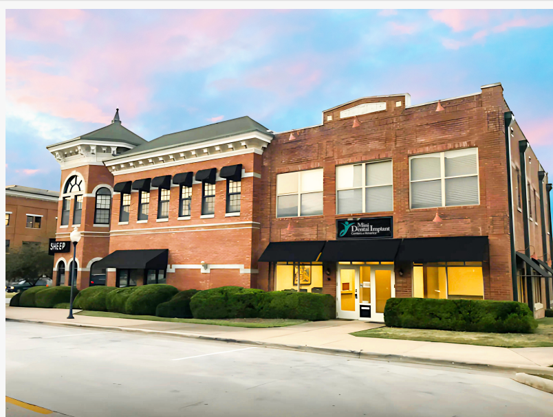
Mini Dental Implant Center of America - Springfield, MO

His leadership and educational involvement reflect a deep commitment to advancing the field of mini dental implants through evidence-based techniques and patient-focused care.