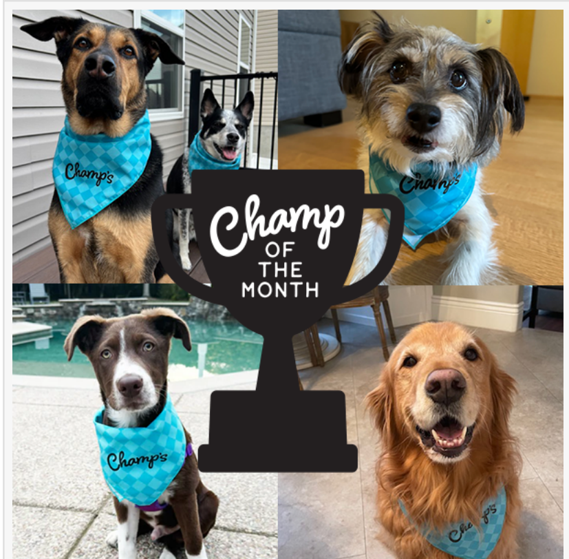
Champ's Pet Kitchen's new “Champ of the Month” program celebrates furry fans of Champ's high protein dog treats.

* Valley Humane Society's Tips for Change Fundraiser at SideTrack Bar + Grill (Pleasanton, CA): Champ's is proud to support Valley Humane and its Tips for Change fundraiser, providing treats