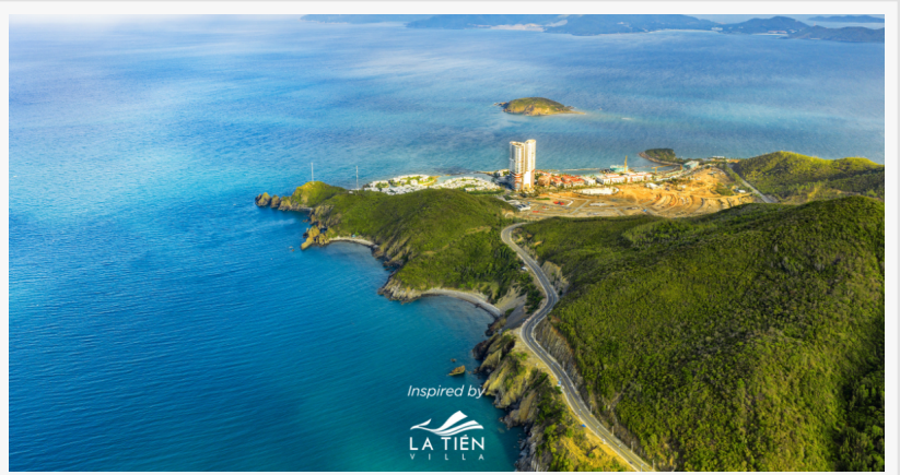
La Tien Villa is the first and only compound villa in the centre of North Nha Trang

The survey's second phase, launched on 16 July 2025 to August 24, 2025, drew over 300 respondents on its first day. Of these, 98% cited natural beauty and a healthy climate as Nha Trang's greatest appeal, while 82% valued the friendliness of residents and 79% pointed to affordable living costs. Looking ahead, about 80% believe the city has the infrastructure to serve as a southern economic gateway, and 75% see this as a factor driving population growth and workforce attraction.