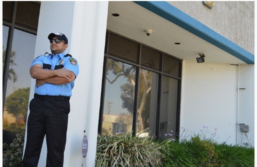
security for office buildings

These comprehensive security offerings are being integrated into a broad range of commercial, industrial, and residential settings. From high-rise office buildings and retail centers to private estates and event venues, service providers are implementing tailor-made security plans that combine physical presence with advanced monitoring systems. These efforts are significantly enhancing safety protocols, minimizing risks, and deterring potential threats in both public and private spaces.