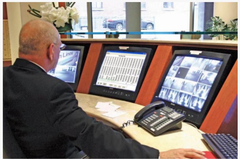
Entry Area Security Guard

Security services in Los Angeles, CA now incorporate a multi-layered strategy that addresses the growing concerns of local residents, business owners, and event organizers. With crime rates varying across neighborhoods and properties facing a wide range of threats from vandalism and theft to trespassing and unauthorized access, there is an increased demand for sophisticated and adaptable security solutions. These services go far beyond traditional on-site guard duties, integrating a combination of technology, personnel training, and strategic planning to offer comprehensive protection.