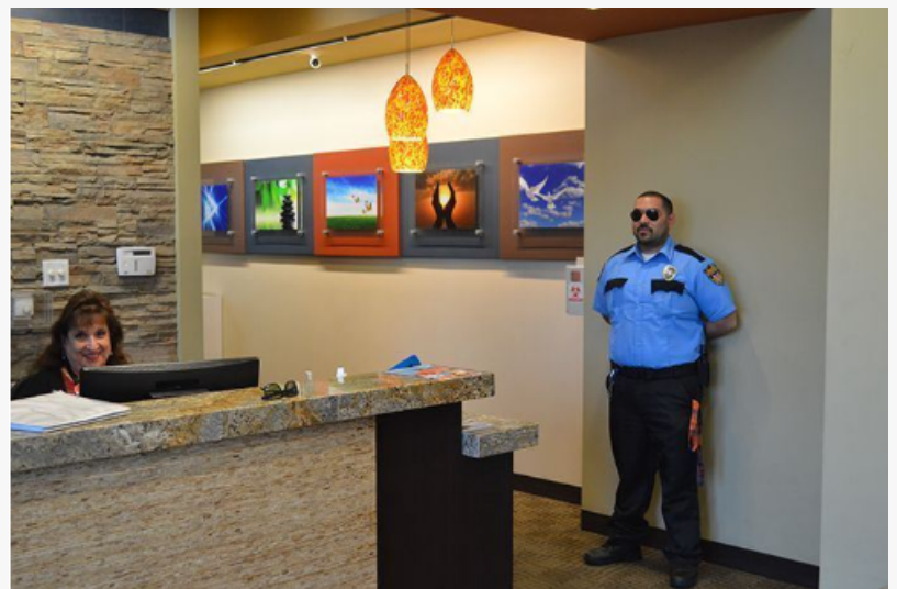
personal security guards