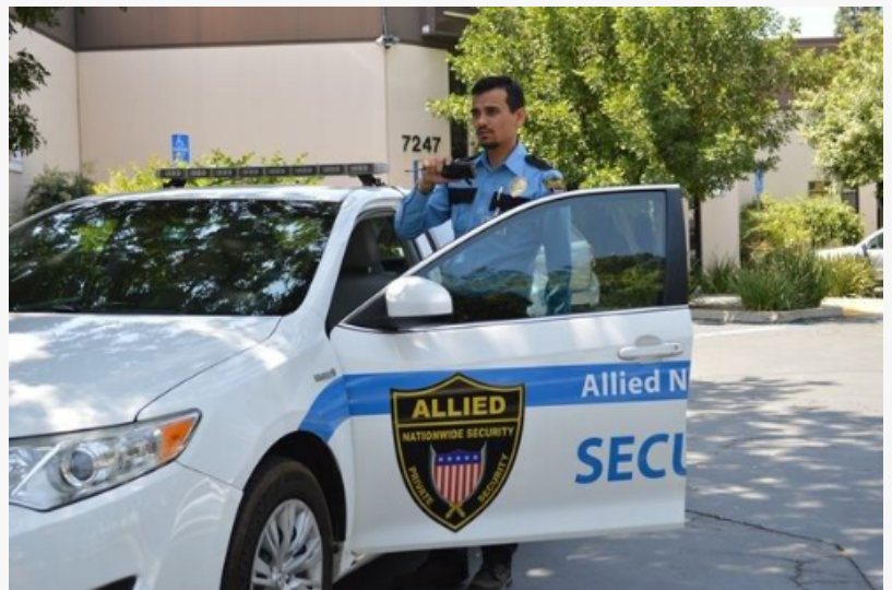
security services los angeles ca