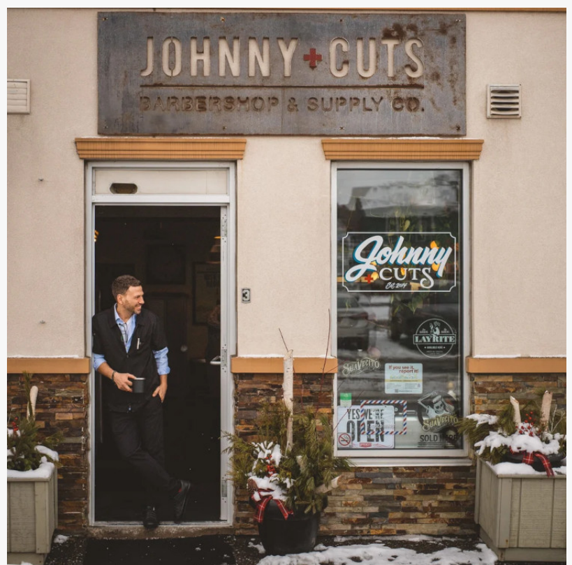
Johnny Cuts Barbershop