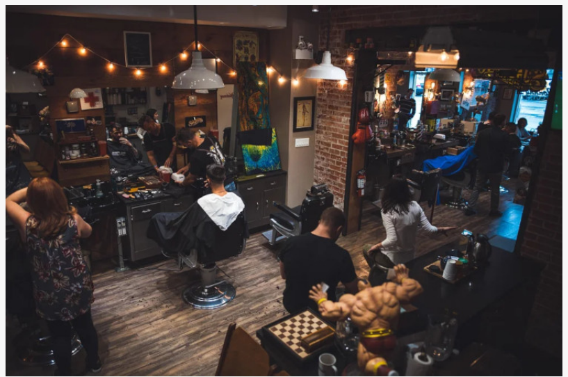
Inside Johnny Cuts Barbershop