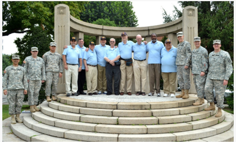
Vietnam veterans of the 1st Signal Brigade Association (in blue shirts) and the 1st Signal Brigade Command Team assemble for a picture in South Korea.

Activated in South Vietnam on April 1, 1966, the 1st Signal Brigade was tasked with establishing a unified communications network that combined both tactical and strategic capabilities across