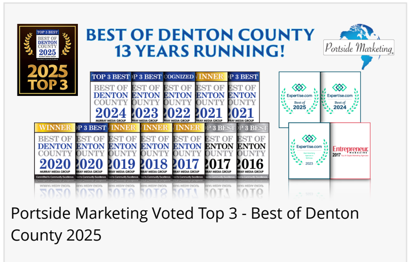
Portside Marketing Voted Top 3 - Best of Denton County 2025

The Top 3 Marketing Specialists program is a respected contest that recognizes outstanding