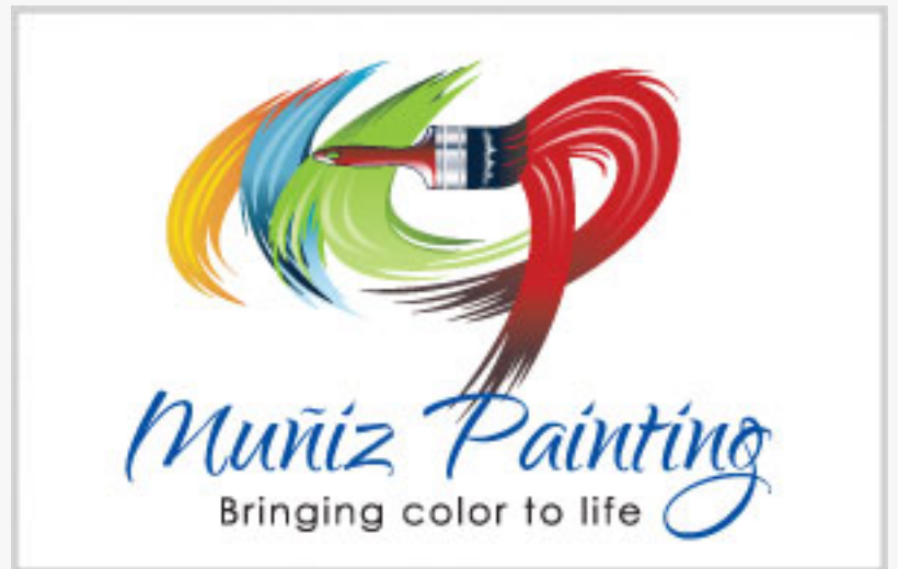
Logo Design - Portside Marketing - Muniz Painting Brand