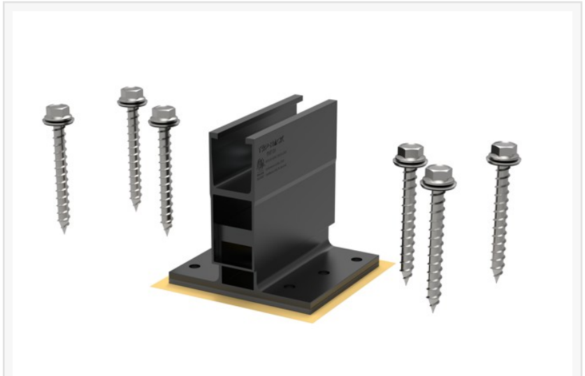
TRT 01 Rail-less Base

These tests were performed at Intertek B&C's state-of-the-art facilities in West Palm Beach, Florida, and York, Pennsylvania, both renowned for their stringent standards and reliable data. The results affirm the TRT™-01 Rail-Less system's