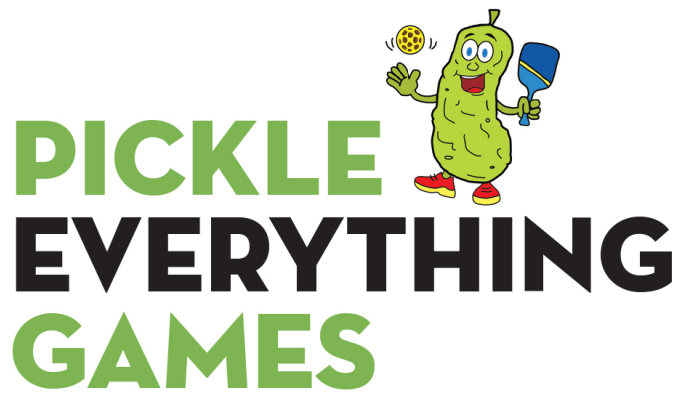
Pickle Everything Games Logo