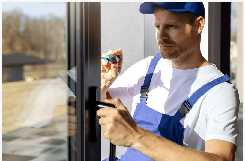
emergency glass repair

In cases of emergency glass repair, the team follows detailed protocols to remove damaged panels, inspect frames, and install temporary or permanent replacements. Technicians are trained to handle laminated, tempered, and insulated glass commonly used in both commercial and residential settings. Replacements are matched based on size, clarity, and safety standards,