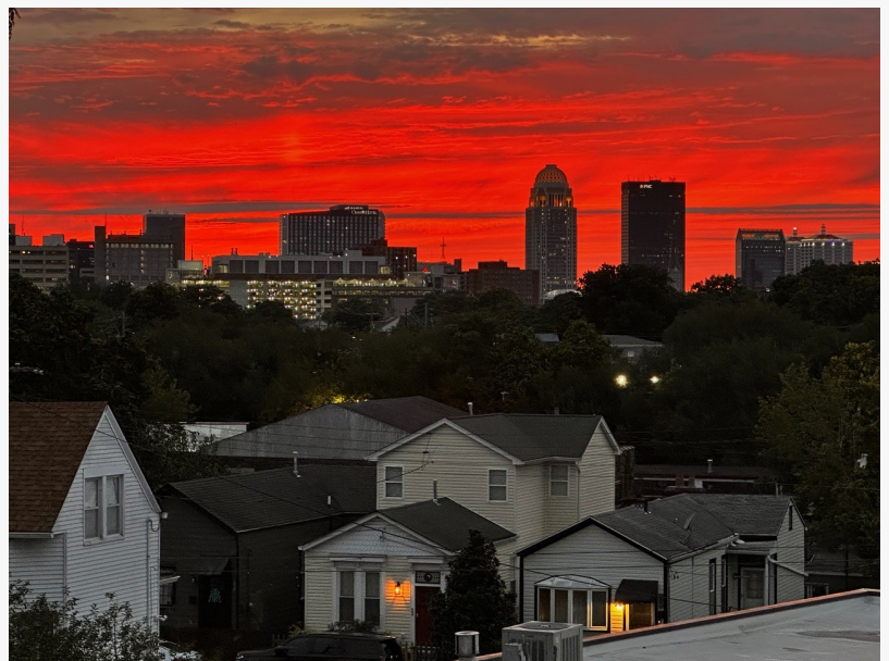
Sunset from the Quonset Hut.