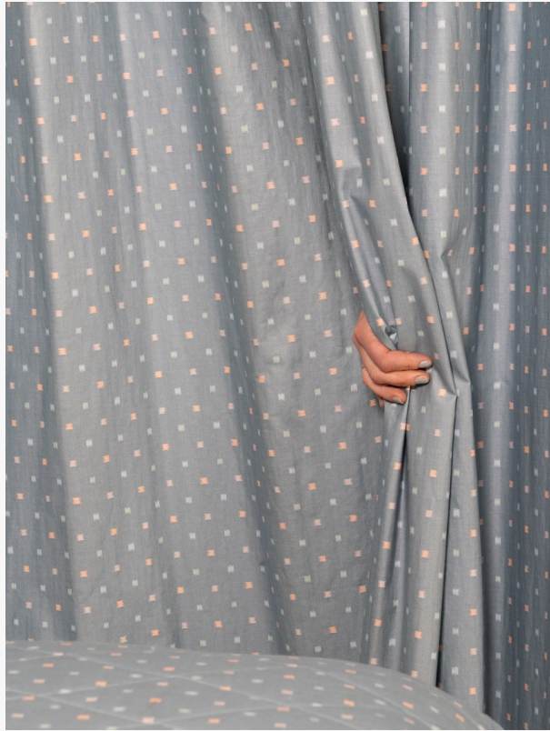
"Wary", from The Quonset Hut's upcoming Rosalie Rosenthal show in conjunction with Louisville Photo Biennial.