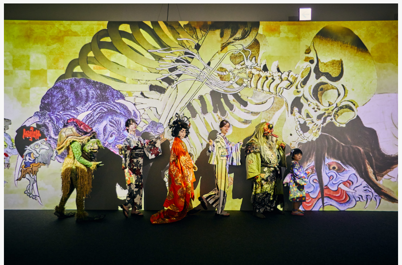
YOKAI Immersive Experience Exhibition NAGOYA – Official Photo: Hyakki Yagyo

□Immersive Learning – Explore Yokai Culture Through Rare Artworks and Expert Interpretations