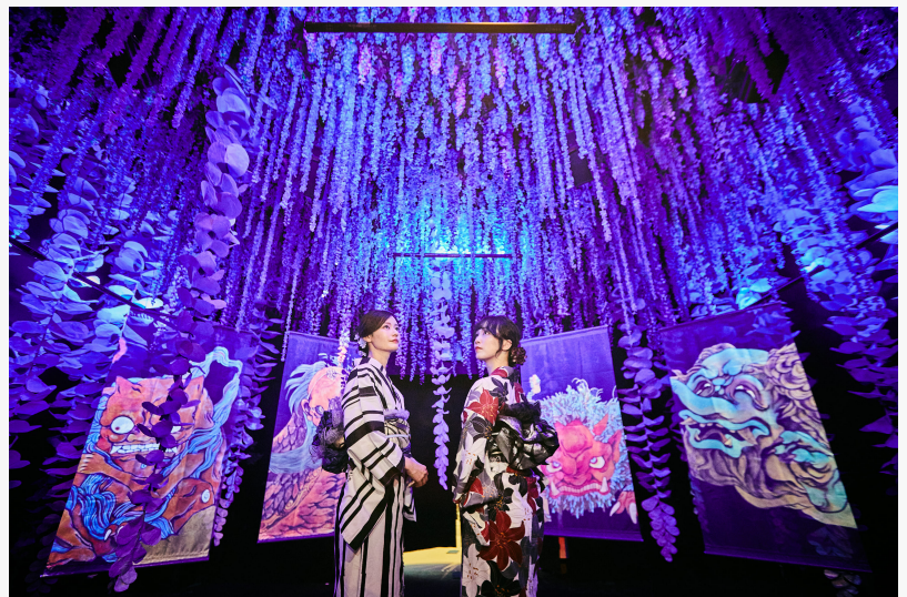
Yokai Wisteria Corridor: An immersive video experience surrounded in the fragrance of wisteria.