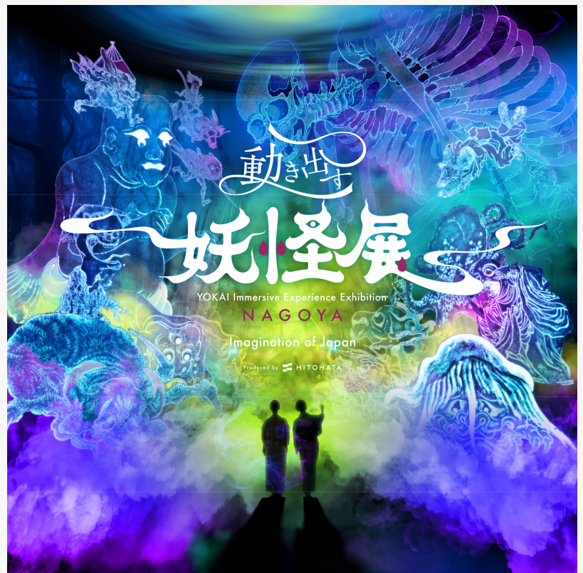
Main Visual of YOKAI Immersive Experience Exhibition NAGOYA

Born from the rich imagination rooted in ancient Japanese myths and folklore, Japan’s yokai have captivated people worldwide across generations. This exhibition brings their humorous depictions from traditional yokai paintings and caricatures to life using cutting-edge digital technologies such as 3D CGI, projection mapping, and holographic screens. Additionally, realistic