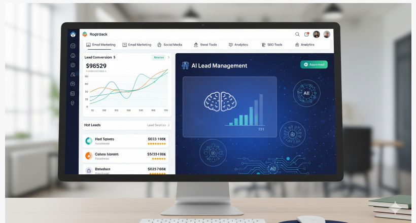
BaaDigi 360 Marketing