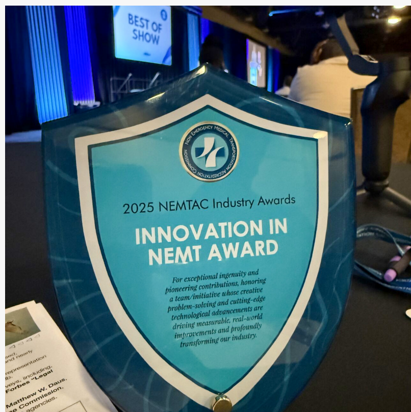
Bambi Wins NEMTAC Innovation in NEMT Award

Bambi's award-winning software demonstrates measurable improvements in NEMT scheduling and dispatch , establishing new operational benchmarks for excellence in NEMT. Bambi leverages AI in a cutting-edge approach to NEMT that has earned recognition from industry peers and positioned Bambi's software as a transformative force in transportation technology.