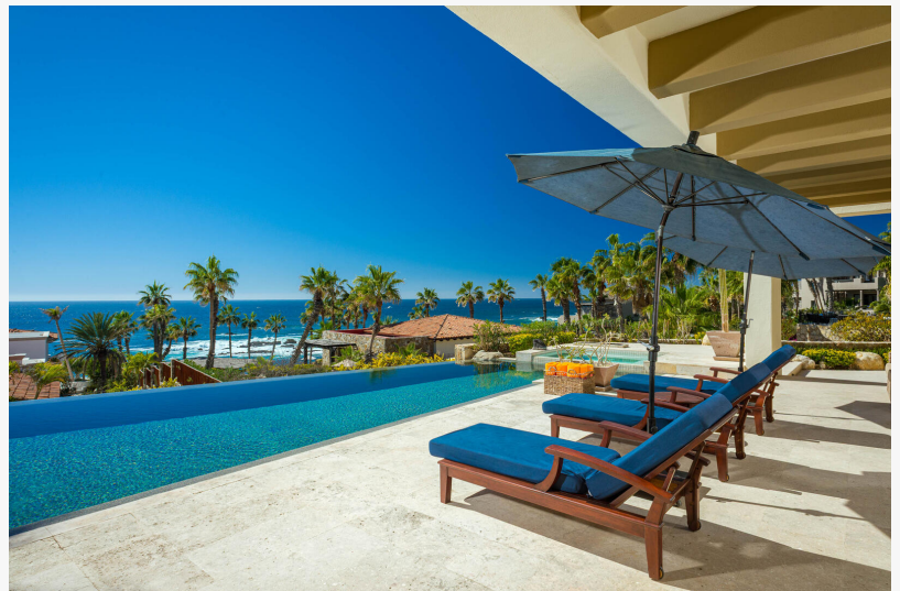
Casa Par - Beach club access and golf cart included, starting at $1,700 per night.