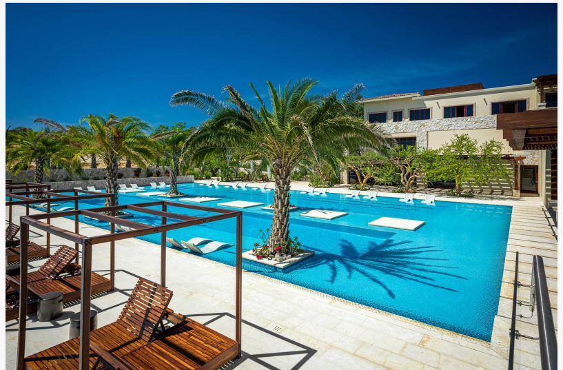
Villas del Oro 106 - Relaxing retreat with Palmilla Dunes Club access, starting at $425 per night.

Today's travelers are putting a bigger emphasis on comfort and personal space. Rather than sharing pools and dining areas with hundreds of strangers, villa guests can relax in private settings that feel like their own homes. Many villas come with private pools, fully equipped kitchens, and spacious living areas where groups can spend time together without the noise and crowds. Each property is professionally cleaned before arrival, and most include daily maid service, so guests can enjoy the ease of a resort with the comfort of a private stay. Small details like on-site laundry rooms and thoughtful amenities make longer vacations simple and stress-free.