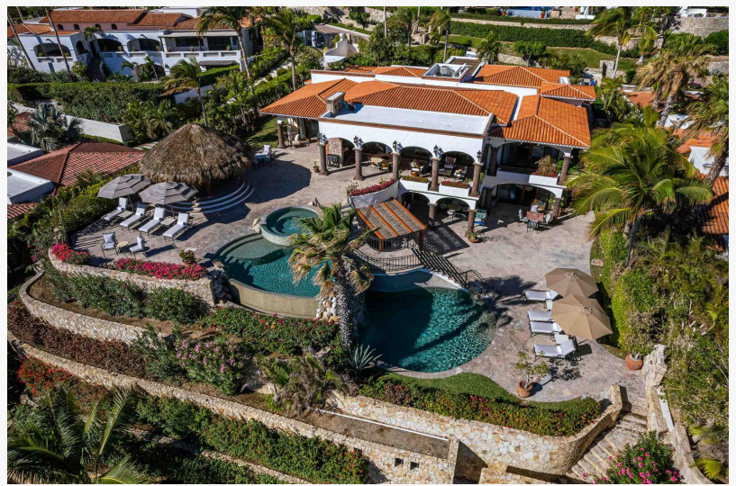
Casa Alegria - Spacious escape with private cook and butler included starting at $1,700 per night.

Food is often where travelers notice the biggest difference between resorts and villas. Resort dining typically follows strict schedules and buffet options, while villa guests have complete freedom. They can cook for themselves, enjoy the services of a private chef, or explore Cabo's incredible restaurant scene. Sun Cabo's concierge team helps plan every detail in advance, from grocery pre-stocking and tequila tastings to romantic beach dinners and reservations at top local spots. Meals become part of the experience rather than just another routine on the itinerary.