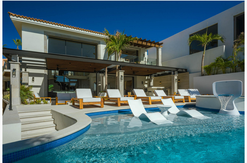
Villa Mareas - Entertainment haven including gym and cold plunge, starting at $4,000 per night.

Alicia Biring Sun Cabo Vacations +1 800-710-2226 email us here