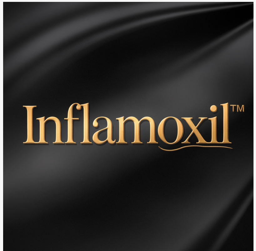
New Trademark Imflamoxil