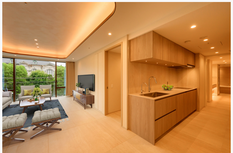
Mita Garden Hills PM #302 | Concierge Auctions

Located in the heart of Tokyo, Shibuya is one of the world's most dynamic urban districts, serving as the epicenter of Japan's continuous redevelopment and innovation. This vibrant neighborhood attracts global technology giants, including Google and ByteDance, alongside cutting-edge startups, creating an atmosphere of constant energy and opportunity. The area boasts world-renowned Michelin-starred establishments, including celebrated venues like Tempura Kondo and L'Effervescence, alongside spectacular rooftop bars and restaurants offering panoramic city views. Within walking distance, residents can explore the sophisticated neighborhoods of Ebisu, Daikanyama, and Omotesando, each offering distinctive cultural experiences and luxury retail destinations. The iconic Shibuya Sky observation deck provides breathtaking perspectives of the metropolis, while nearby venues like Bunkamura present world-class performing arts programming. Cultural landmarks include the bustling Shibuya Crossing, Miyashita Park's elevated green space, and the upscale shopping destination of Shibuya Hikarie. From intimate izakayas to internationally acclaimed restaurants, this neighborhood offers an unparalleled culinary landscape that reflects Tokyo's position as a global