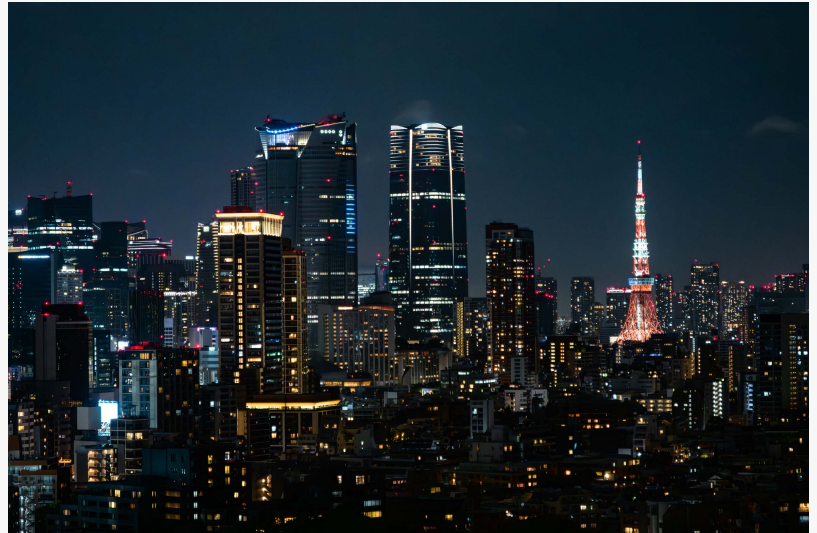
Proud Tower Shibuya 2601 | Concierge Auctions