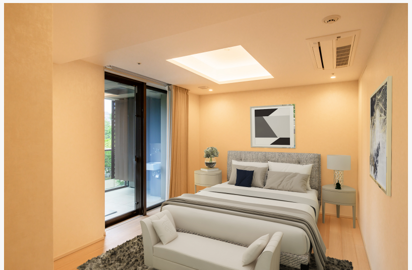
Mita Garden Hills PM #302 | Concierge Auctions