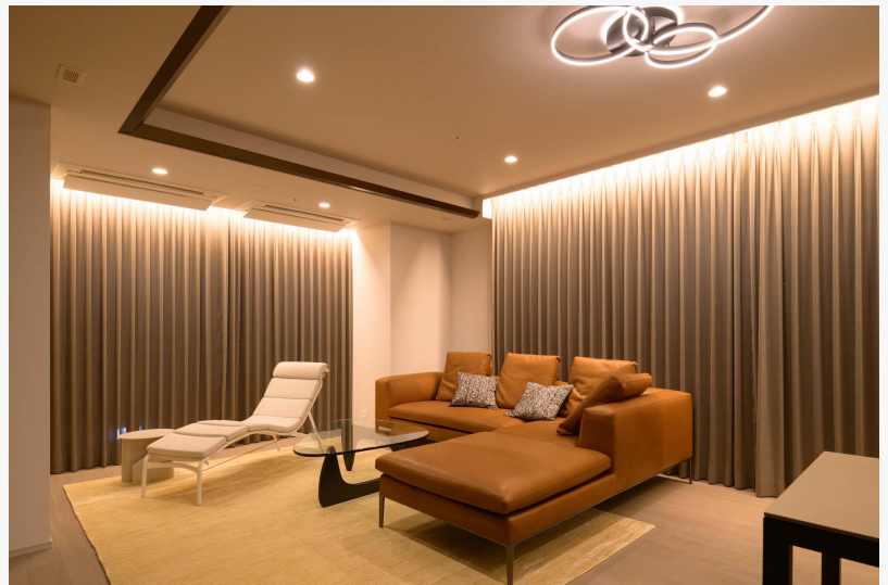
Proud Tower Shibuya 2601 | Concierge Auctions

Tower, Roppongi, and Shibuya, complemented by a forty-eight-square-meter rooftop terrace—an urban rarity. Curated interiors by The Conran Shop Japan showcase Italian modern sophistication with B&B Italia and Fritz Hansen furnishings, a ¥15 million package included with the sale. The boutique tower of just one hundred thirty-two residences offers a sky deck,